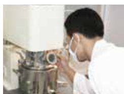
• Innovation of product