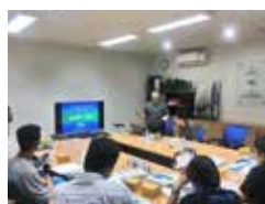
• Product training for customers