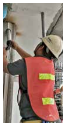
• On site Technical Service