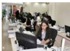
• Customer Care Service that our competitors and business associates speak about.